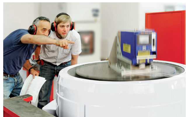
LDS shaker system from Hottinger Bruel & Kjaer (HBK)

Vibration Profile Design uses the fatigue damage spectrum (FDS), a mathematical approach described in standards NATO STANAG 4370 (AECTP-240)/UK DEF STAN 00-35/MIL-STD-810G. With the FDS, engineers can apply widely used fatigue concepts like the SN curve and Miner's Rule for damage accumulation. The FDS is computed from either measured vibration data or existing shaker specifications to quantitatively assess the potential for fatigue failure in parts that are exposed to vibration loading. It provides a relative fatigue damage estimate based on acceleration levels and exposure time.