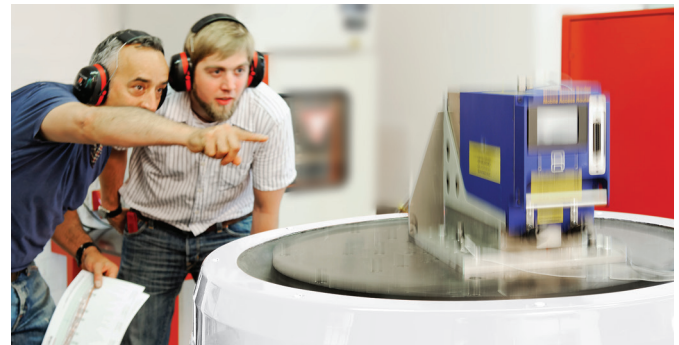
LDS shaker system from Hottinger Bruel & Kjaer (HBK)

Vibration Profile Design uses the fatigue damage spectrum (FDS), a mathematical approach described in standards NATO STANAG 4370 (AECTP-240)/UK DEF STAN 00-35/MIL-STD-810G. With the FDS, engineers can apply widely used fatigue concepts like the SN curve and Miner's Rule for damage accumulation. The FDS is computed from either measured vibration data or existing shaker specifications to quantitatively assess the potential for fatigue failure in parts that are exposed to vibration loading. It provides a relative fatigue damage estimate based on acceleration levels and exposure time.